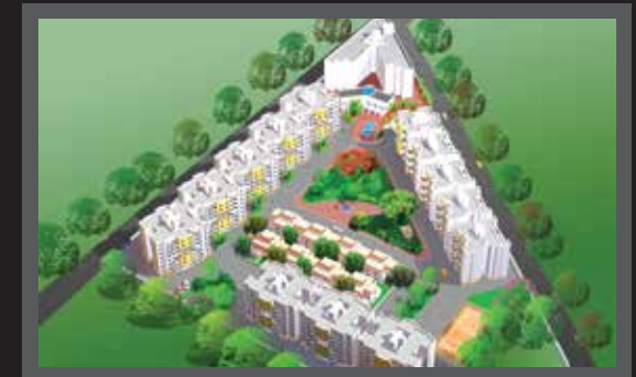
ELITE EMPIRE, BALEWADI