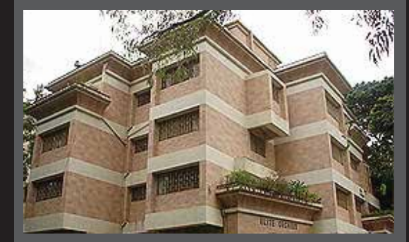
ELITE ORCHIDS, AUNDH