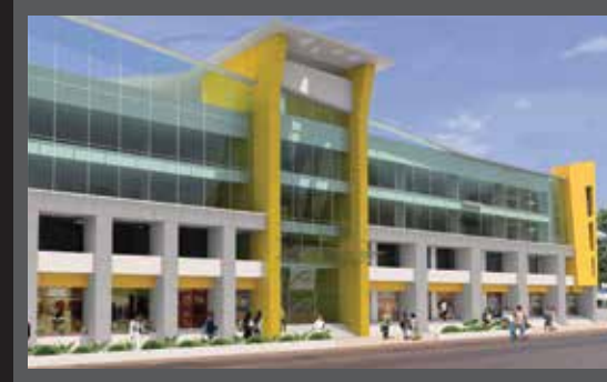
ELITE PREMIO, BALEWADI