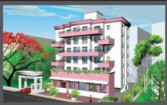
ELITE GARDENS, AUNDH