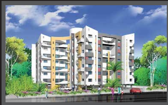
ELITE GALAXY, BAWDHAN