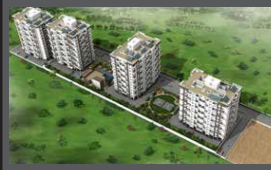
ELITE HOMES, TATHAWADE