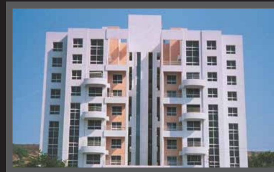
ELITE EMBASSY, BAWDHAN