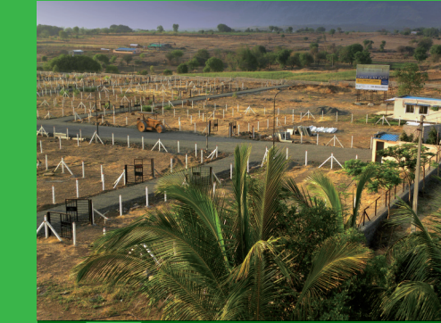
Birds eye view of site