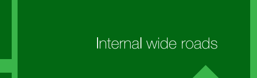
Internal wide roads