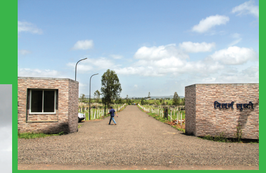
Site Entrance Gate